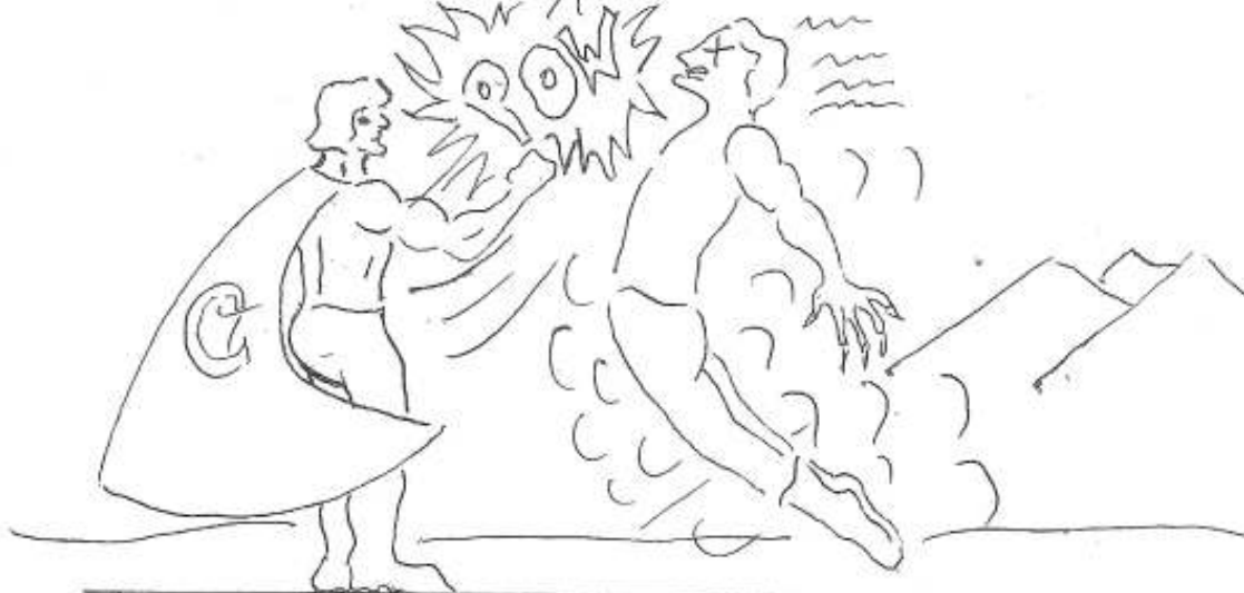
CHICKAMAN MEETS MR. UNHYGENIC